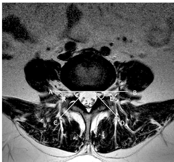
Figure 2. Facet tropism measurement. AB is the reference line. The angle between AB and line AC is the right facet angle (R), and the angle between AB and line AD is the left facet angle (L)