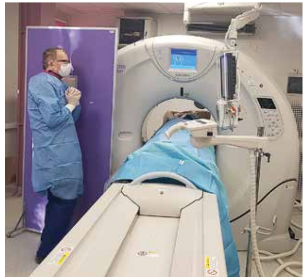
Figure 2. A quick-check computed tomography scan – a radiologist operating the pedal while remaining behind the lead screen