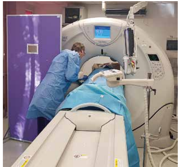
Figure 1. Needle insertion – a radiologist reaching the needle-entry site inside the gantry

All procedures were performed under local anaesthesia. The procedure protocol in our Institution consists of a helical scan of 100-160 mm covering the region of interest and allowing for localization of the given lesion and planning of the relevant procedure. It is followed by a 3-slice series (of 4 mm – 8 mm – 4 mm slice thicknesses)