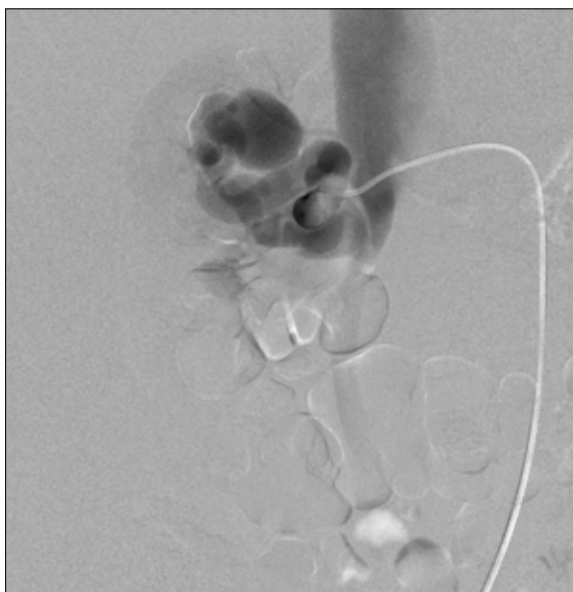
Figure 2. Angiography of the right renal artery dorsal branch provided before the procedure showing the fistula with an aneurysm. Arterial phase tissue phase.

The procedure was performed by puncturing the right femoral artery under local anesthesia using the Seldinger technique. Aortography was performed using a pig-tail diagnostic catheter. Angiography showed an elongated, expanded renal artery branch with an aneurysm (21 mm in diameter). The artery supplied 20% of the right renal parenchyma. In the next stage, a guiding catheter (Envoy 5 F) was placed in the right renal artery and then a micro-catheter (Progreat, Terumo) was introduced selectively into the tortuous branch. Then, NBCA mixed with lipiodol at a concentration of 60% was injected into the malformation. A control angiography showed a complete occlusion of both the aneurysm and the fistula. Twenty percent of the renal parenchyma was excluded. The perioperative period was without complications. Dexamethasone at a dose of 8 mg was recommended for the subsequent 4 days after the intervention. The patient was discharged after 5 days of hospitalization with a recommendation to perform a follow-up angio-CT after 3 months and after one year. A follow-up angiography confirmed an effective exclusion of both the aneurysm and the fistula (Figure 3) [2].